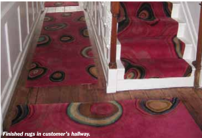
Finished rugs in customer's hallway.