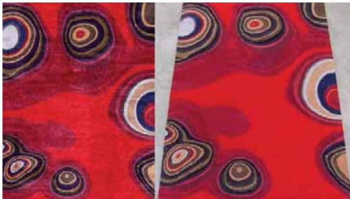
Left – computer simulation before production, and right – actual rug photographed after production.