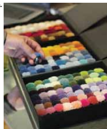
Tuft box – samples can be replaced in 24 hours.

“While the appropriate use of technology is transforming the