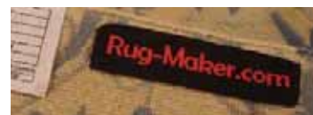
Clear-labelling promotes the rug-maker.com name.

production end, it is equally benefiting the importing and distribution channel as well,” he continues.