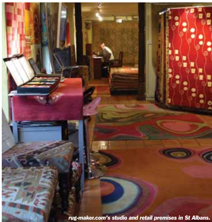
rug-maker.com’s studio and retail premises in St Albans.

“Therefore, many importers of Nepalese hand knotted rugs are also using the same software as their manufacturers so that they can